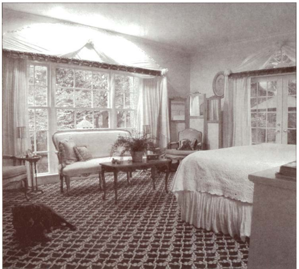
▲ A wall of windows and French doors leading to an outside sitting area enhance the spaciousness of this remodeled bedroom.