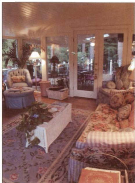
▲ The homeowners and their guests can enjoy the outdoors all year-round in the cozy sunroom.

used as a library-type sitting room or an office. He converted this to a beautiful guest bedroom with its own private bath and an exit way to the new veranda.