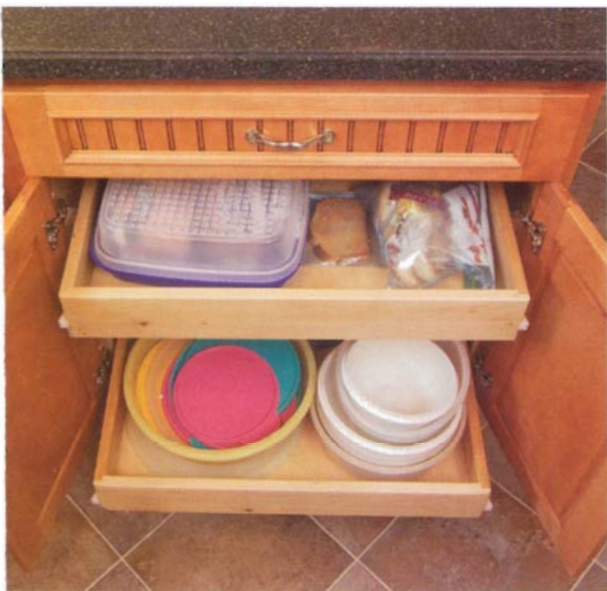
ABOVE: Located in the peninsula, these pull-out drawers, designed to hold bowls and containers, provide convenient, accessible storage without having to get on your hands and knees.

“Our new kitchen is more than just gorgeous,” says Pat, “it’s also extremely efficient.” ■