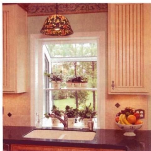
The extra-deep garden window above the sink was designed to give Cy and Pat a place to grow herbs and small plants.

RIGHT: By eliminating the island and adding a peninsula, the new layout has a tight work triangle and a breakfast counter. A new storage hutch replaces the old desk.